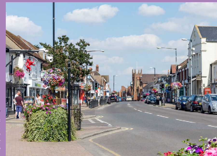
HIGH STREET Situated on Billericay's vibrant high street, Squire House offers an incredibly convenient location, right in the heart of the action.