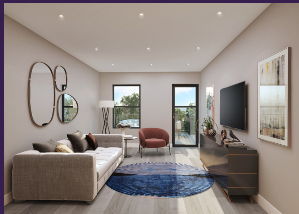
Computer generated imagery is indicative only.