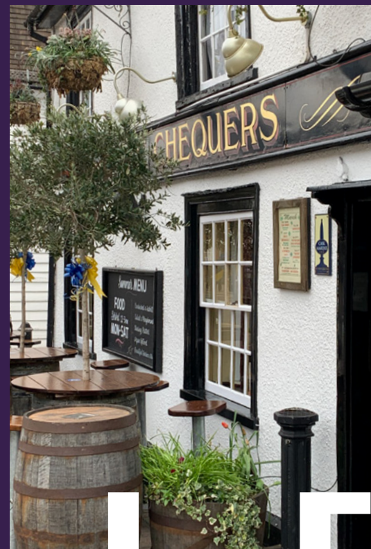
THE CHEQUERS Pop over the road for drinks and a bite at this local favourite.

Just feet from your front door you'll find an impressive choice of restaurants and cafés, and one of the area's most-loved local pubs, as well as a great selection of shops.