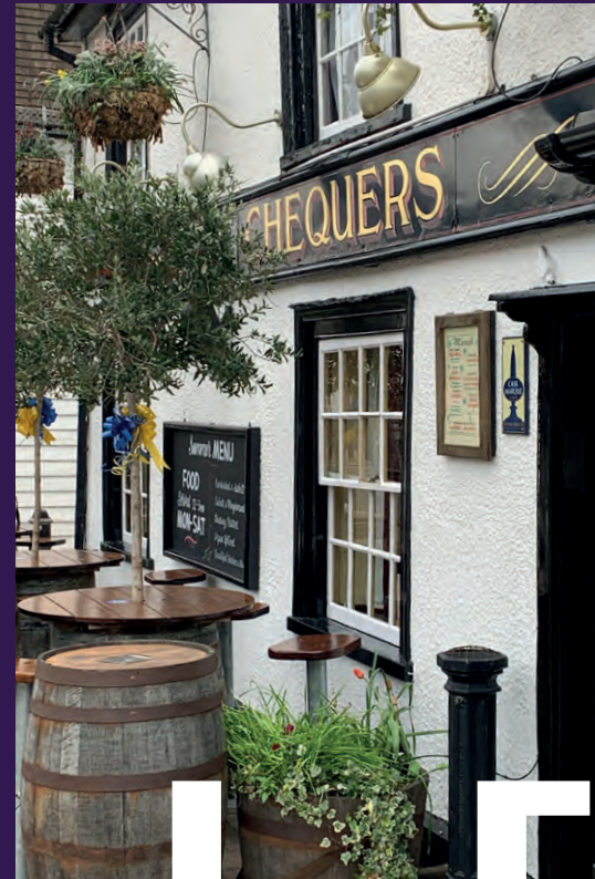
THE CHEQUERS Pop over the road for drinks and a bite at this local favourite.

Just feet from your front door you'll find an impressive choice of restaurants and cafés, and one of the area's most-loved local pubs, as well as a great selection of shops.