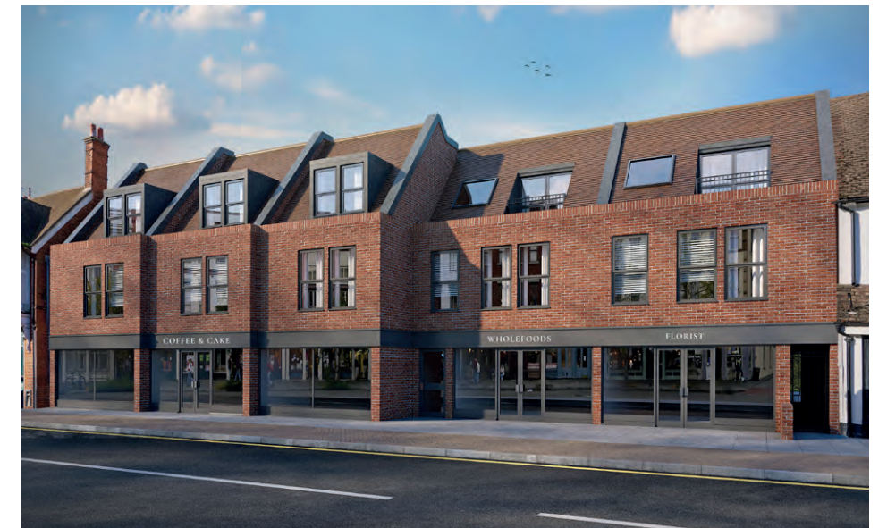
Computer generated imagery is indicative only.