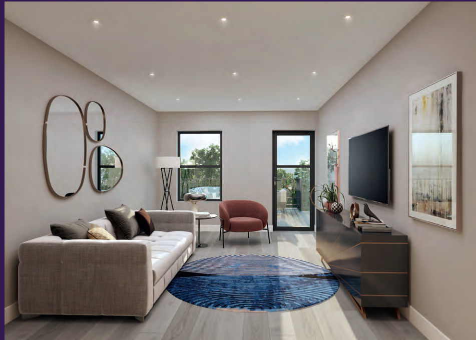
Computer generated imagery is indicative only.