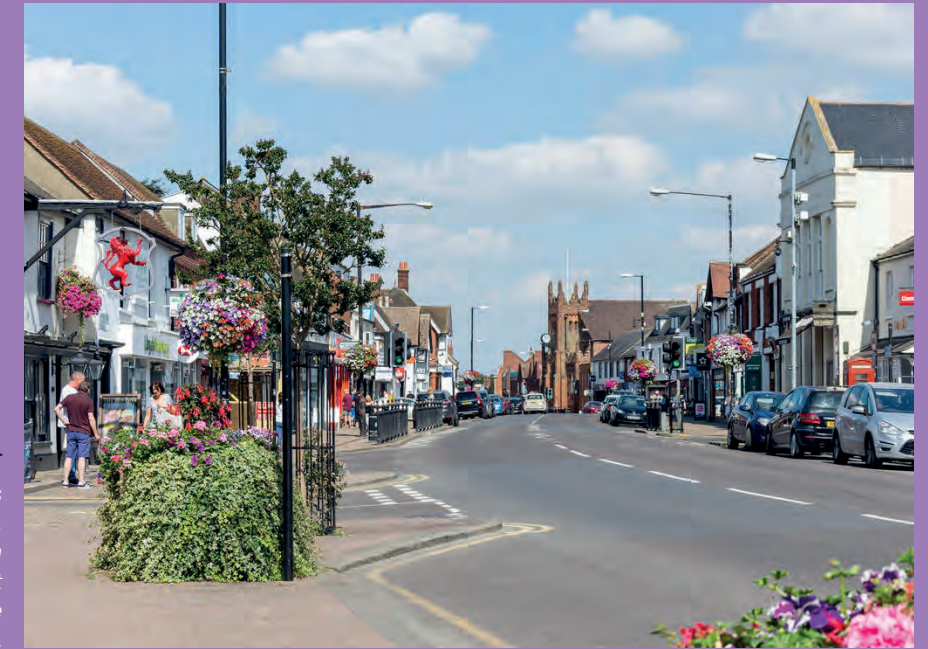
HIGH STREET Situated on Billericay's vibrant high street, Squire House offers an incredibly convenient location, right in the heart of the action.