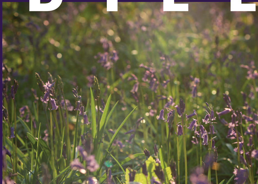
NORSEY WOOD Just a short walk to the fresh air and picturesque trails of Norsey Wood nature reserve.