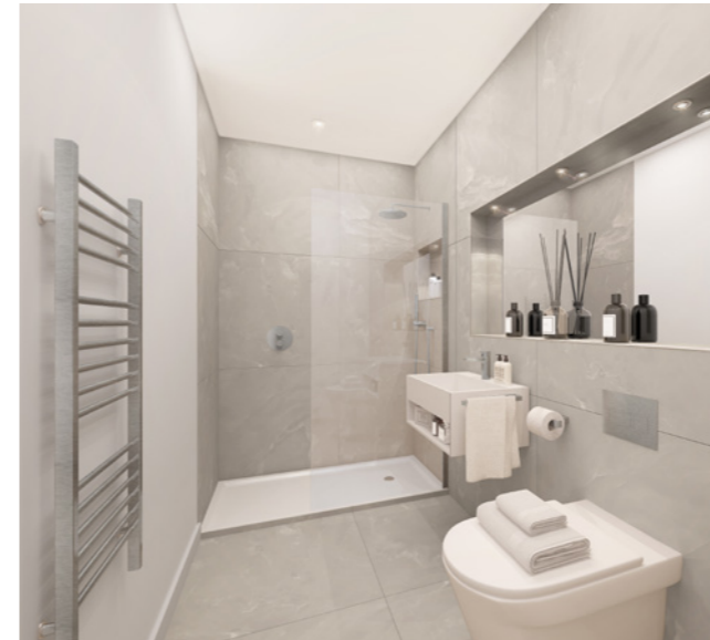
Bathroom fixings – brushed stainless finish