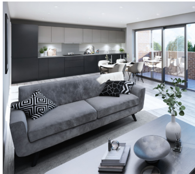
Fitted kitchen – graphite / light grey finish