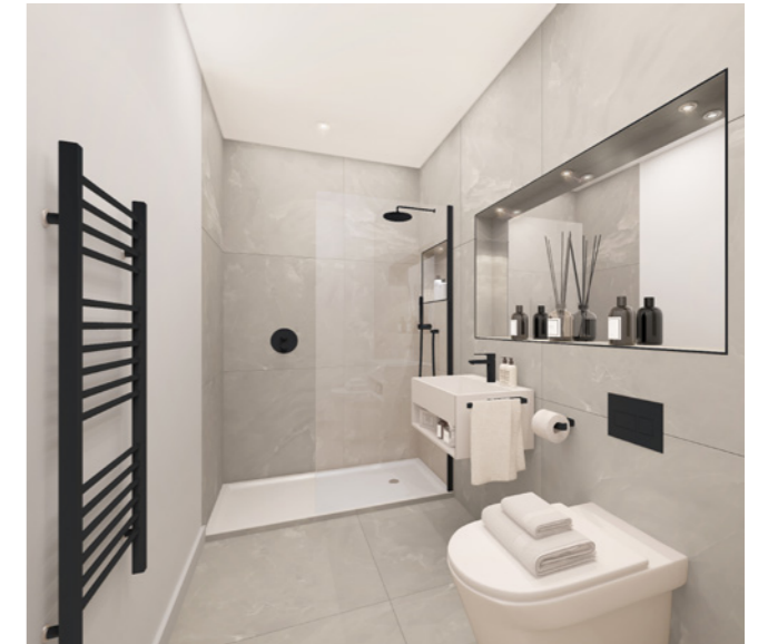
Bathroom fixings – black finish