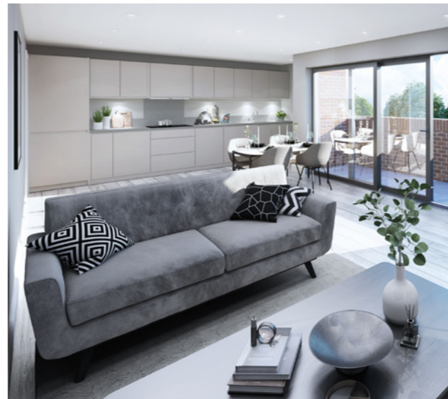
Fitted kitchen – light grey / light grey finish