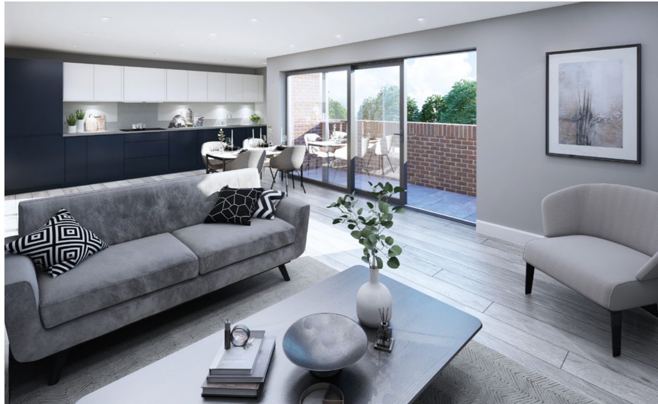
Fitted kitchen – blue / white finish

For more information contact your sales advisor.