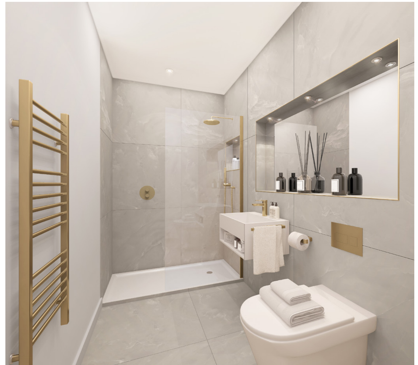
Bathroom fixings – brushed gold finish